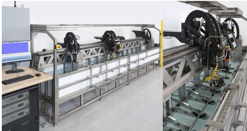
Figure # 2: Immersion Ultrasonic Test Unit, Banner Commercial Carol Stream, IL

Banner Commercial has installed and commissioned a state of the art Ultrasonic Testing unit in our Carol Stream, IL facility. We elected to acquire this highly sophisticated piece of equipment for two reasons: 1) to provide our customers the ability to cost effectively and readily comply with industry wide and customer specific requirements, and 2) to give customers the ability to design a process which mitigates risk in their operations. Figure 2 depicts our UT equipment installed and commissioned: